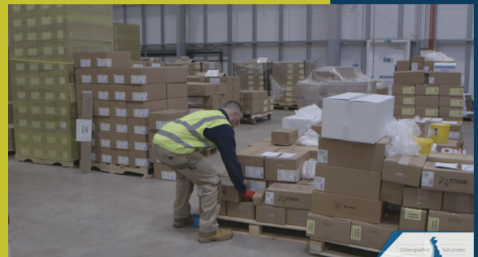
Lifting with Knee Injuries