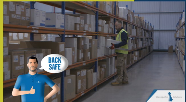
Handling from Shelving