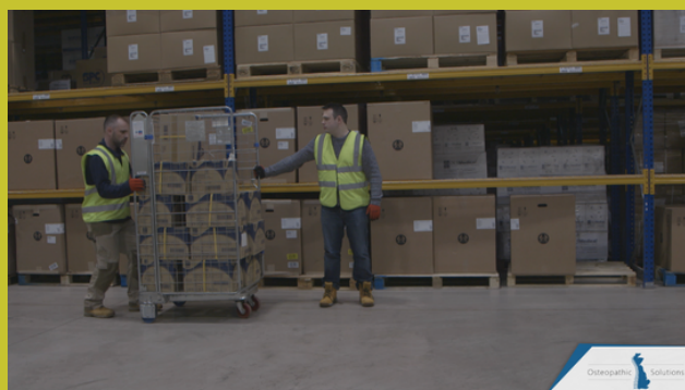
Team Pushing & Pulling